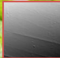
Non biodegradable surface