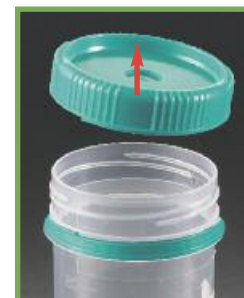
When removing the tamper evident screw cap for the first time, the perforation is severed, thereby ensuring easy recognition that the container has been opened.