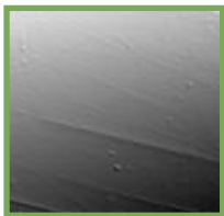
Non biodegradable surface

Image of high-density surface after 12 months soil burial