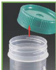
Open container and collect specimen.