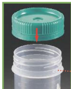
Screw cap until a clicking noise is heard. This is when the plastic ring (which is attached to the base of the cap), is firmly seated and locked over the container threads.