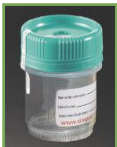
On sterile model, intact label ensures sterile container has not been opened.