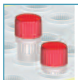
Tubes with ribs lock in place when engaged in serrated holes.