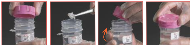
Remove Screw Cap.