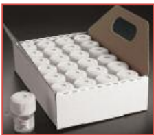
M961 Series packaged in sturdy cardboard boxes with handles for easy carrying.

The HistoTainer™ II is half filled with a choice of fixatives. 10% Neutral Buffered Formalin penetrates quickly, but fixes slowly. The Formalin is enhanced by a buffering capacity optimizing histological results by light microscopy and immunohistochemistry. Bouin, Hollande and Zinc Formalin fixatives are also available. Please contact Simport for minimum ordering quantities.