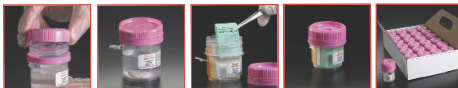
When opening the container, the tamper evident ring will detach itself from the cap.